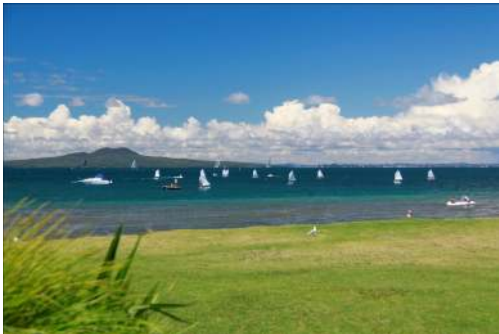
A GORGEOUS DAY FOR THE FIRST WATERWISE SESSION OF 2012